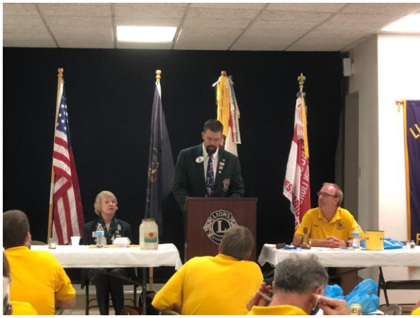
Bushy Run Lions Club - 1