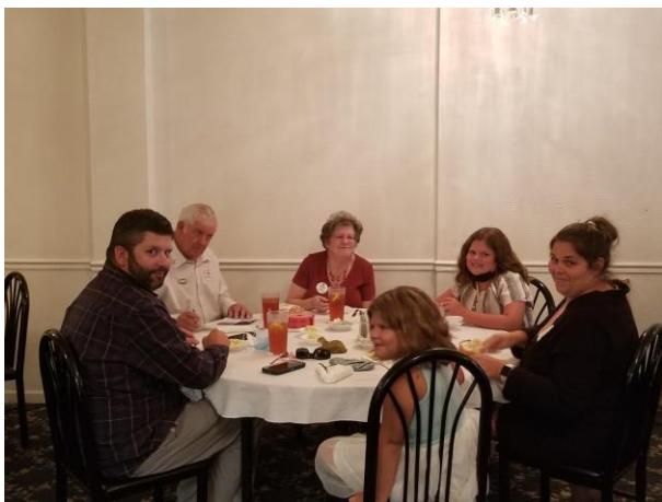
Rostraver Twp Lions Club - 2