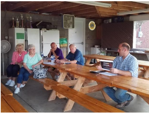
Zone 3 Meeting - 3