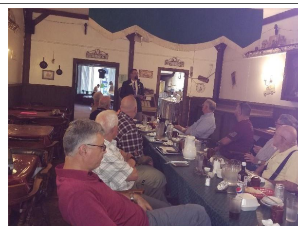
New Florence Lions Club - 4