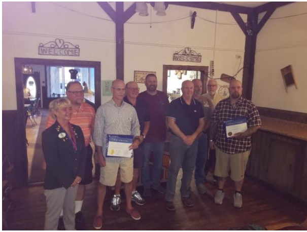
New Florence Lions Club – 5 Welcome new members!