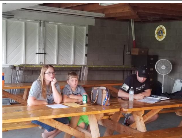
Zone 3 Meeting - 2