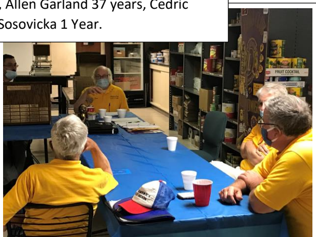
Allegheny Twp Lions Club: Perfect Attendance Awards