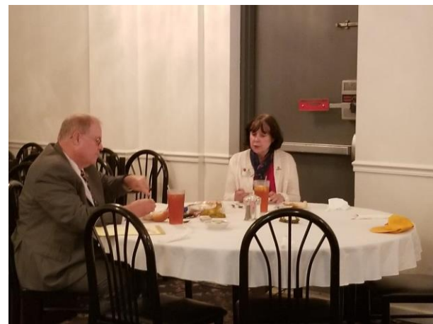
Rostraver Twp Lions Club - 3