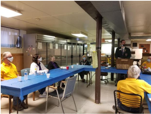
Allegheny Township Lions Club - 1