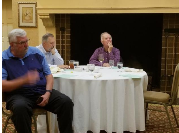
Greensburg East Hempfield Lions Club - 2