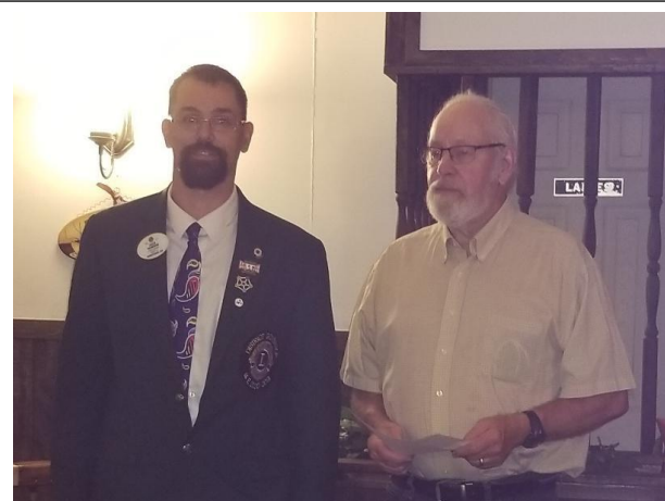
New Florence Lions Club -2: Years of Service Chevron presented