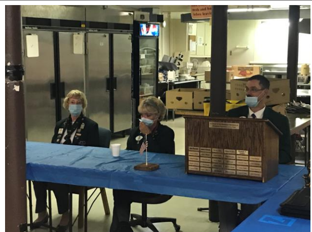
Allegheny Twp Lions Club: Perfect Attendance Awards