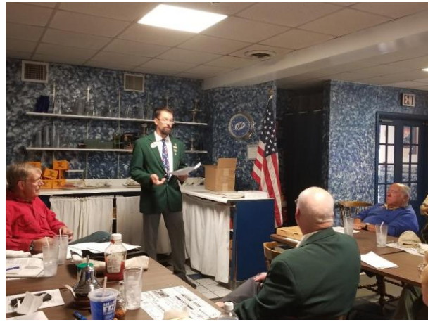
Youngwood Lions Club – 1