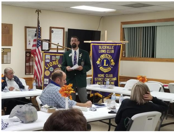
Slickville Lions Club - 2