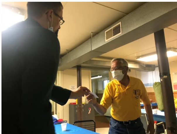
Allegheny Twp Lions Club: Perfect Attendance Awards