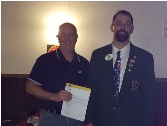
New Florence Lions Club – 1: Years of Service Chevron presented