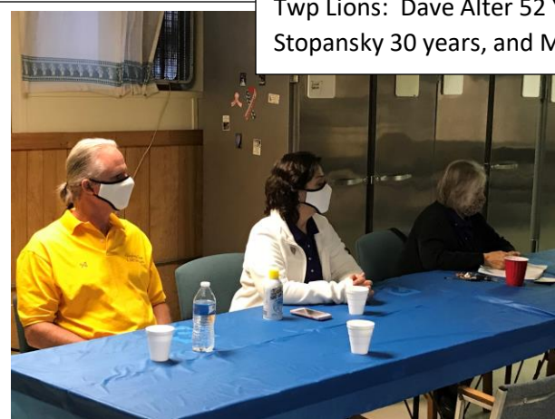
Allegheny Twp Lions Club: Perfect Attendance Awards