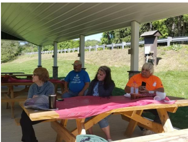
Derry Lions Club - 1