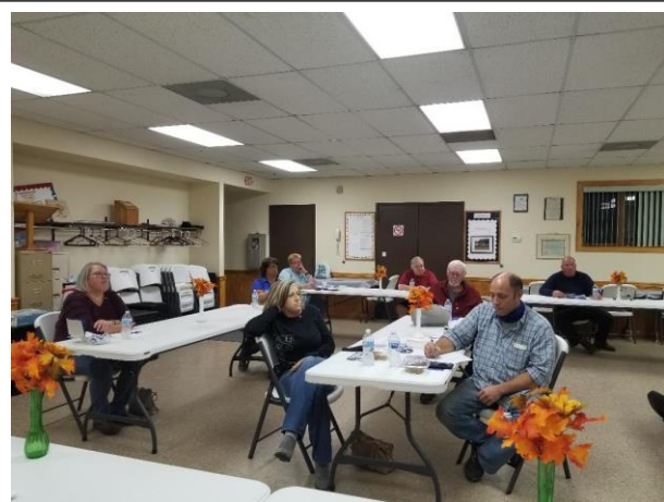
Slickville Lions Club - 5