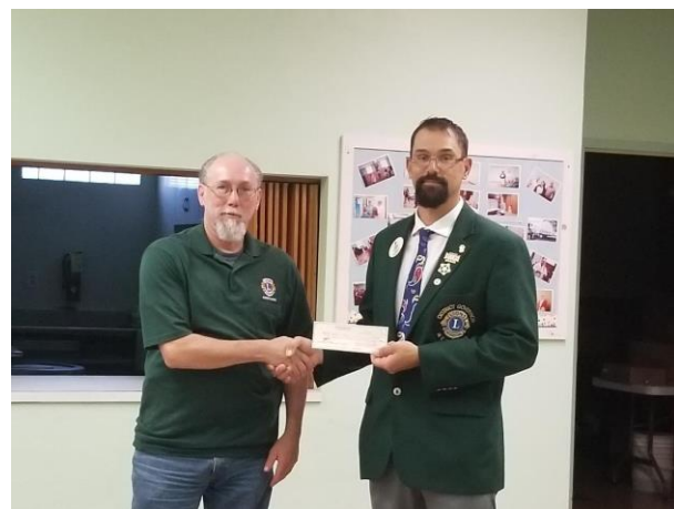
Arnold Lions club 2 Present District Donation Check