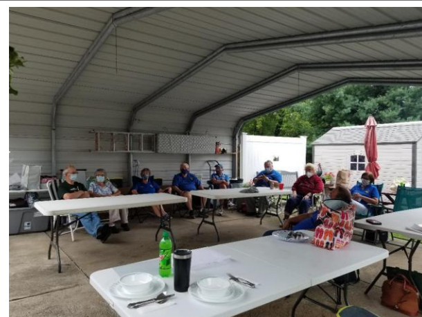
Stewartville Lions Club - 2