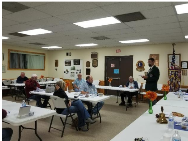
Slickville Lions Club - 4