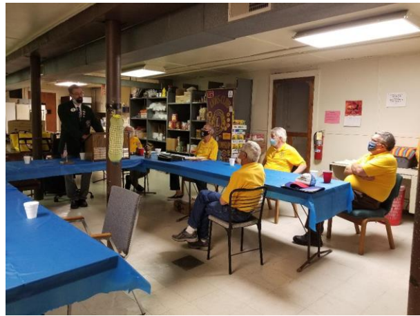
Allegheny Township Lions Club - 2