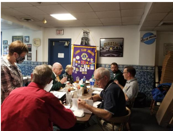
Youngwood Lions Club – 2