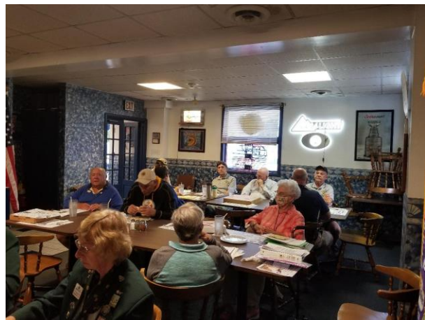
Youngwood Lions Club - 3