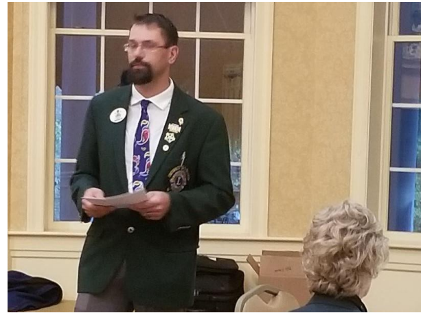
Greensburg East Hem

Mt. Pleasant Twp. Lions present $4,000.00 check to Westmoreland County Blind Association