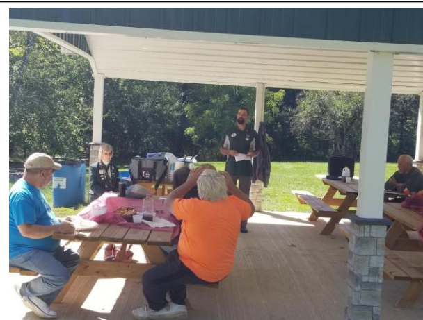
Derry Lions Club - 2