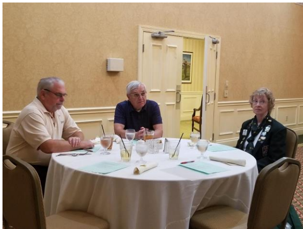
Greensburg East Hempfield Lions Club - 1