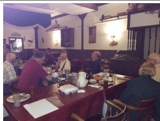
New Florence Lions Club - 3