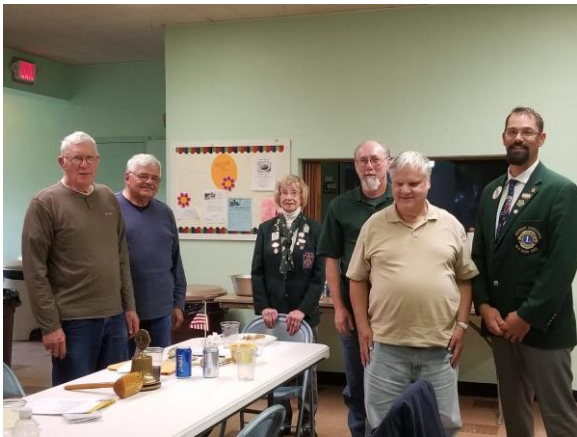
Arnold Lions Club - 1