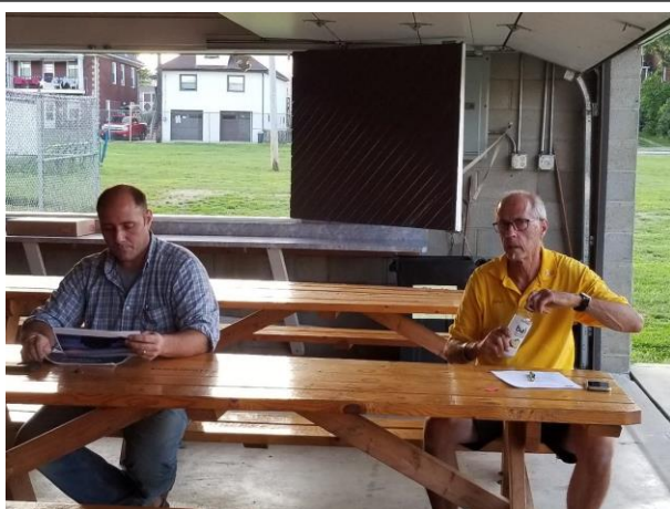
Zone 3 Meeting - 1