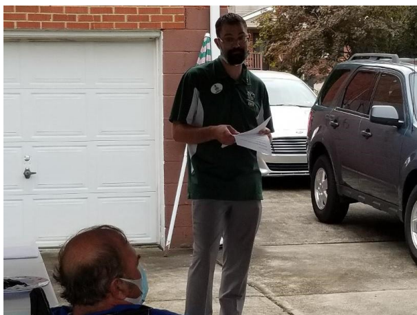
Stewartville Lions Club - 1