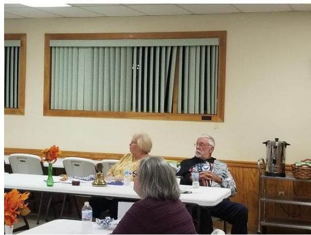
Slickville Lions Club - 3