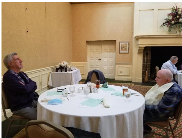
Greensburg East Hempfield Lions - 3