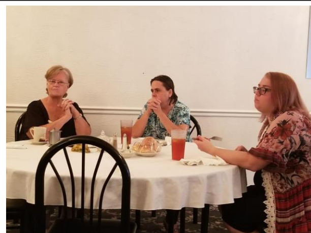
Rostraver Twp Lions Club - 4