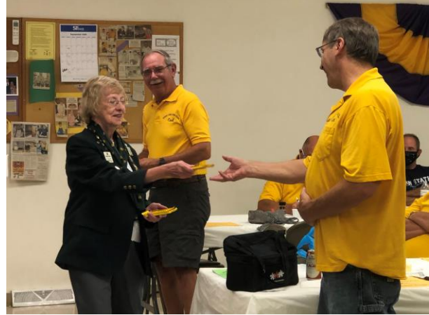
Bushy Run Lions Club - 2