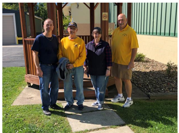
Bushy Run Lions volunteer packing boxes for the WCFB. They helped pack over 1300 boxes!