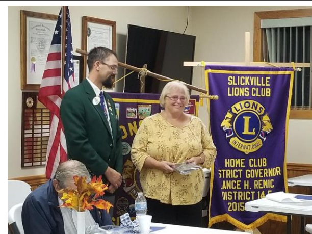
Slickville Lions Club - 1