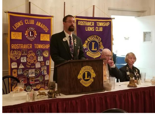
Rostraver Twp Lions Club - 1